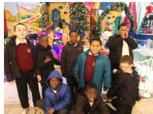
5/6 HC enjoying a trip to explore the festive spirit at Lakeside Shopping Centre

Some students have visited local shopping centres like Lakeside and Barking to enjoy the festive decorations and meet Santa.