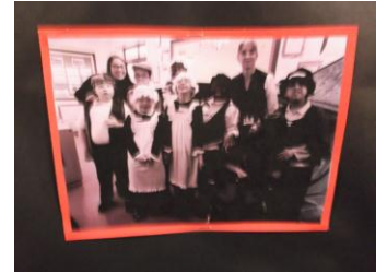
5/6 KS Dressed in Victorian clothes ready for their Valence House trip.

Year 5/6 have been learning about The Victorians and have enjoyed a workshop based around this theme. They have also taken part in a visit to Valence House dressed in Victorian costumes to learn more about Victorian times.